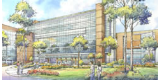
Groundbreaking ceremonies for the new hospital occurred on October 11. The UAMS Auxiliary and Volunteer Services served as Ambassadors.

The hospital expansion, when completed, will give the medical center a capacity of 270 adult beds in private rooms. Plans