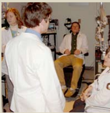
The 2009 ICM II Lab, conducted to teach second year medical students, was held on March 2 at Jones Eye Institute. A total of 153 medical students attended this year.