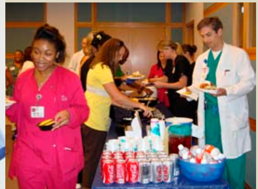
A reception was held in the Bowen Auditorium for the four new OMT I students.