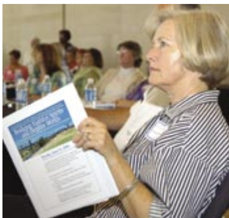
Participants from the mental health and faith communities came together for the informative conference.

This innovative inaugural conference was developed to provide cutting-edge, scientifically-grounded information about mental illness, effective treatments and programs that could expand partnerships between