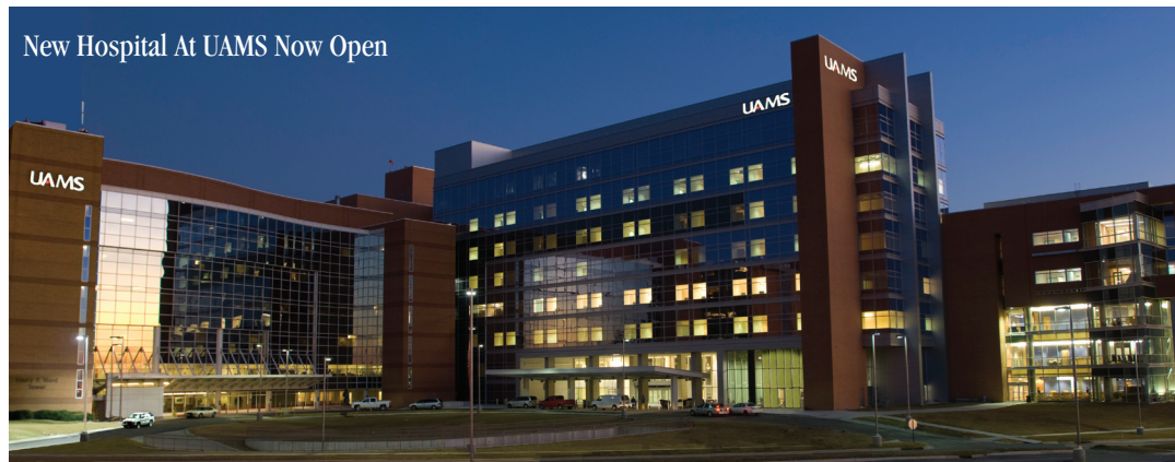
New Hospital At UAMS Now Open

By the time this newsletter is in press, the Department will have undergone the largest move in its history. On January 9 and 10, much of the Department will be shifted to the new hospital that is set to open for patients on January 20th, 2009.