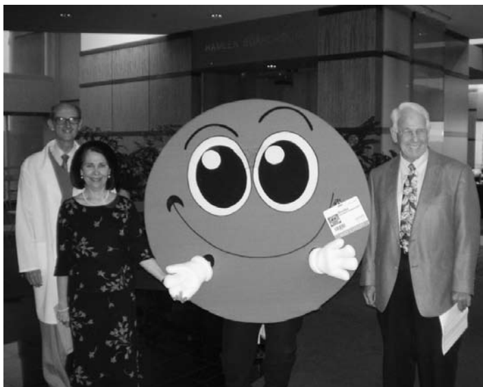
2009 Recipients with 45 years of service.

UAMS offers an accrual recognition program to honor the service and dedication of its employees. Excellent skills and service provided by employees like you have been a central factor to UAMS' success. To recognize employees for their service, UAMS celebrates with Employee Service Awards receptions and a luncheon. Employees who have given five or more years to our campus are recognized and receive a pin indicating their years of service. If you see a co-worker wearing one of these pins, you will know they have built the reputation of our growing campus.