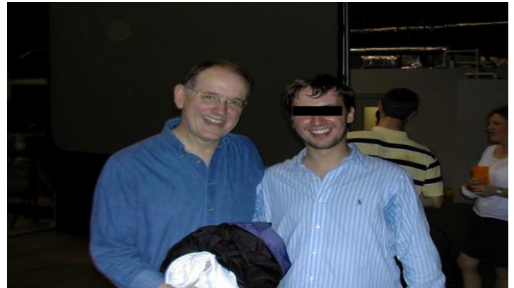
What is that brown stuff on your nose? Closet Gunner kissing up to a UAMS professor.