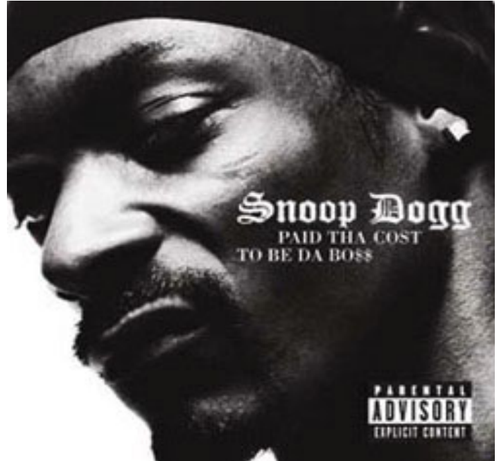
It Ain't Notin' but a W-Thang Baby. Snoop uses his verbal abilities to to send his message to the nation.

She's trippin for shizzle, know what I'm sayin? And check out these two shorties in tha back. Playa pimp's tryin to get him some C-to-the-double-O keys, but he's about to bust his hizzead all over da flizzo. And his lil' sisnat is sayin fool, pass that snack before you go out like a punk. Cuz it was her plan to get some of those C to the Double-O keys all along."