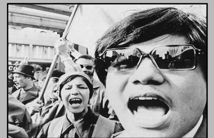
NBMEEEEE! Students protesting against the recent examination.

M1s are protesting over accusations of a lower than normal class average for the Gross Anatomy NBME. Says one student, "I don't believe these NBME scores represent how much we learned. Our class' MCAT scores were way more higher than previous classes." Another M1 stated, "I can't figure out how I did so poorly. I studied so hard for that test. I mean, I knew like all seven cranial nerves, including the pudendal." The M1s recently held a vote to see if they could raise their class average. Unfortunately, the vote had to be unanimous, and sixteen students voted against it.