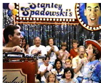
This will only hurt a little bit. M1 begins his daily routine of taking in lecture material.

The American delegation supplied the majority of the proposed solutions. Among the forerunners to re-