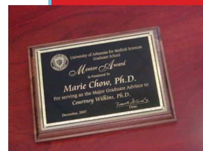
Graduate School Mentor Award plaque