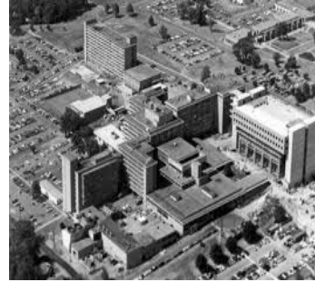
UAMS Campus 1970s