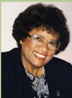
Joycelyn Elders, M.D.